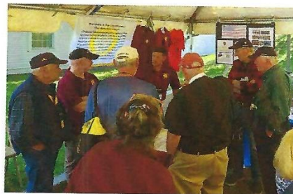
Selling hard on NU Henry Rifle Raffle