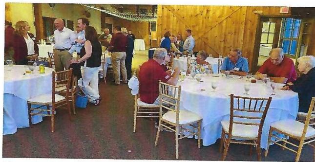
10 year Anniversary Celebration at Sugarbush