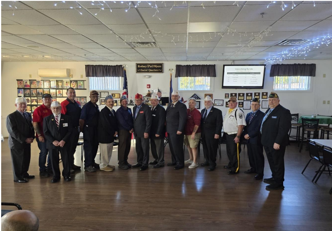
(Visit to Colchester Post 91)

We then headed to the National Commanders Banquet at the Hampton Inn by Hilton in Colchester VT.